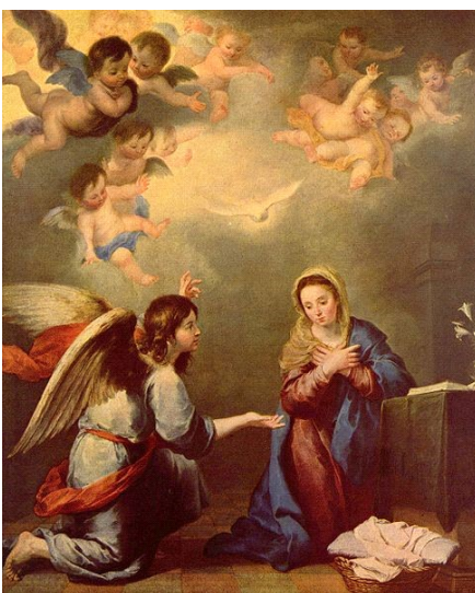
Annunciation, by Bartolomé Esteban Perez Murillo, c. 1655-60, Hermitage Museum

As we celebrate the Solemnity of Mary on January 1 st , we are ever aware that Mary is the sign of hope and salvation. Her story conveys the importance of faith and complete trust in God. Mary places her life in God's hands when the angel Gabriel visits her and tells her of God's plan. Her true grace is revealed: "Behold, I am the handmaid of the Lord. May