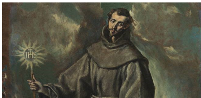
Saint Bernardino of Siena. El Greco Museum. Toledo

The month of January is devoted to the Holy Name of Jesus. The name Jesus in Hebrew means "Savior." His name conveys to us the greatness of His mission and expresses His identity as the Only Begotten Son of God who "...will save his people from their sins." — Matthew 1:21